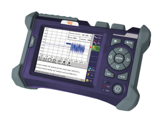
Optical Cable Identifier