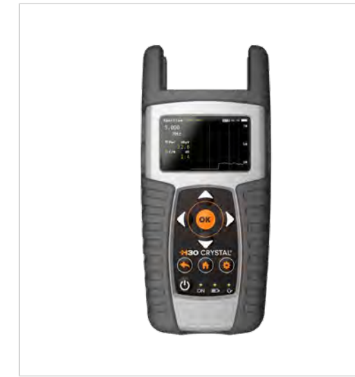
Televes reserves the right to modify the product