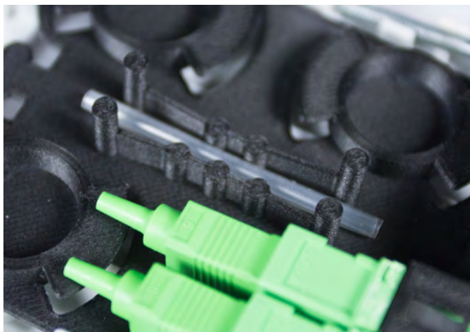
Splice holder pictured above

As each Outlet is completely custom, please contact us with all your required specifications: sales@connectix.co.uk