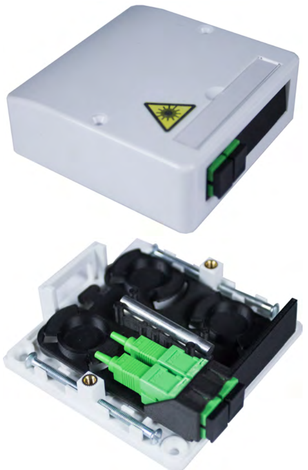
Fibre splitter pictured above, resting on top of the splice holder.