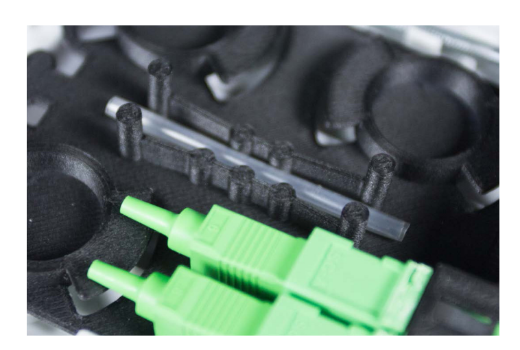
Splice holder pictured above.

As each outlet is completely custom, please contact us with all your required specifications: sales@connectix.co.uk