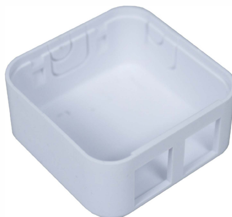
Box cover internal