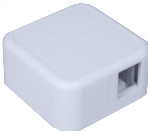
Unloaded box with blank in place