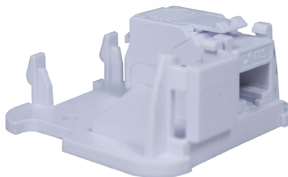
Base plate with blank in place and loaded with one keystone