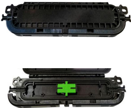
Connectix Internal Demarcation Box 00A-010-555-02